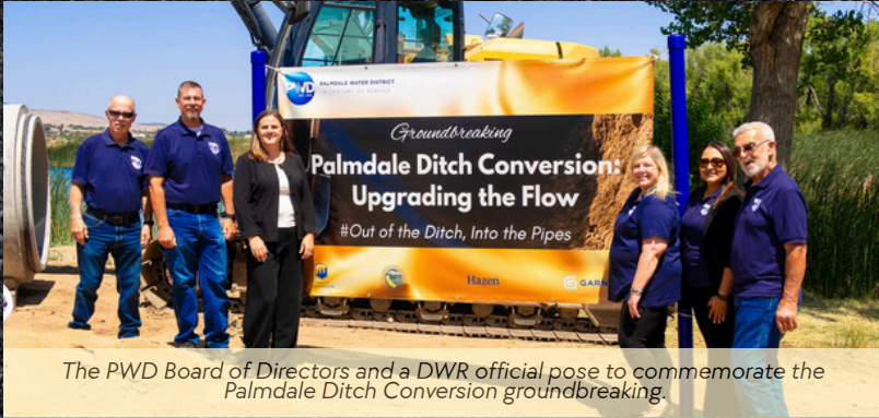
The PWD Board of Directors and a DWR official pose to commemorate the Palmdale Ditch Conversion groundbreaking.

PWD broke ground on the Palmdale Ditch Conversion: Upgrading the Flow project with a celebratory event at Lake Palmdale on June 26. More than 60 people, including a California Department of Water Resources official, Palmdale City Council members, elected officials' representatives, staff and community members, gathered to mark the start of converting the open ditch to an enclosed pipeline.