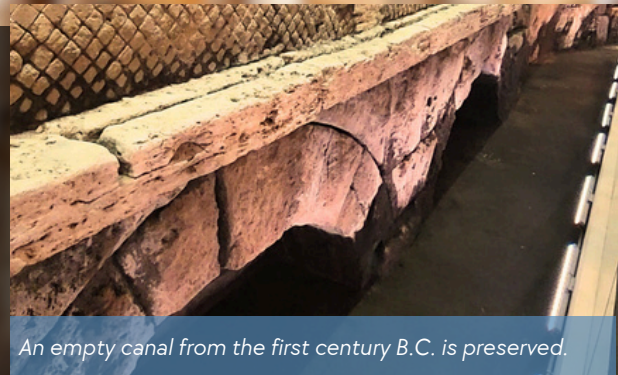
An empty canal from the first century B.C. is preserved.