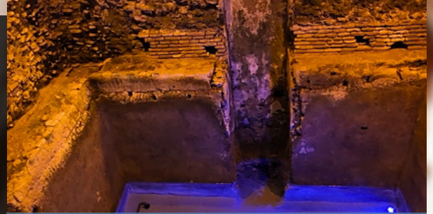
This distribution tank stores water for the Virgin Aqueduct.