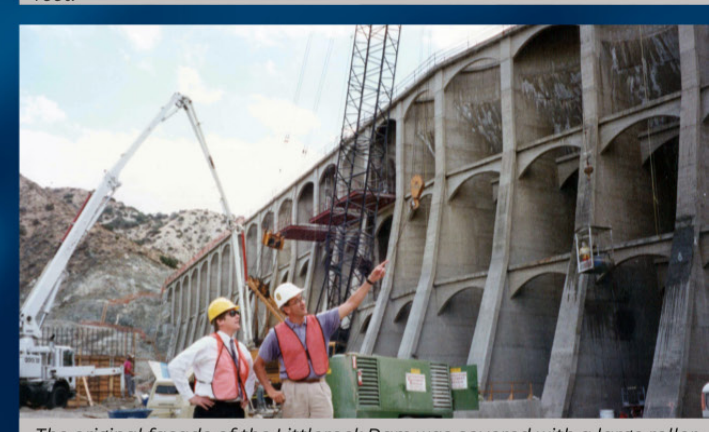
The original facade of the Littlerock Dam was covered with a large roller-compacted concrete buttress in the 1990s.