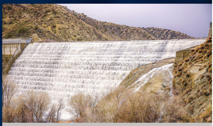
A recent photo of water flowing over the Littlerock Dam's spillway.