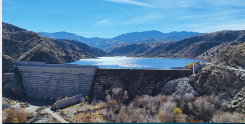
An aerial photo shows a full reservoir at the Littlerock Dam.