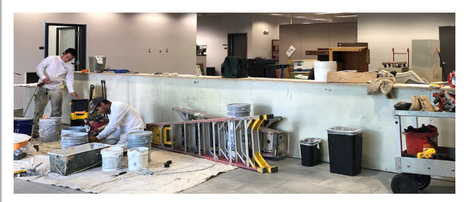
Contractors paint and re-tile the lobby.

In addition to social distancing adjustments made to the lobby, the interior of the 28-year-old main building at 2029 East Avenue Q has received a new coat of paint, carpet and tile, and new cubicles were installed. The remodeling project was initially scheduled for the end of the year but was completed during the closure to prevent disruption to staff and services to the public.