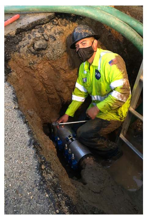
Face coverings became part of the uniform for the crew during the pandemic.

The PWD Board of Directors has been holding teleconference meetings. It is planning to have its first in-person meeting on June 22 with continued public involvement with a teleconference line. To make it safer for the Directors, plexiglass partitions have been placed between their dais chairs.