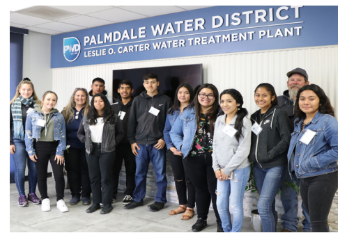
2019 Jr. Water Ambassadors