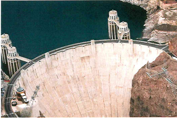
Hoover Dam Tour