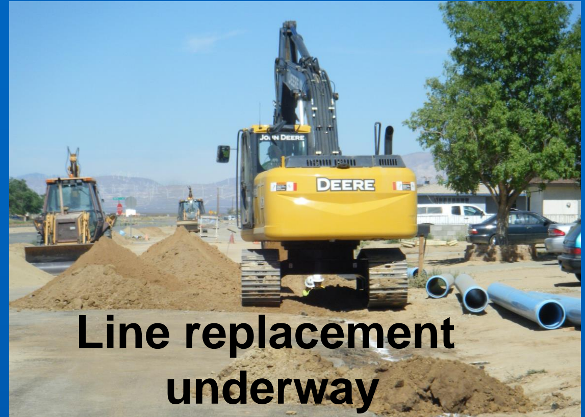
Line replacement underway