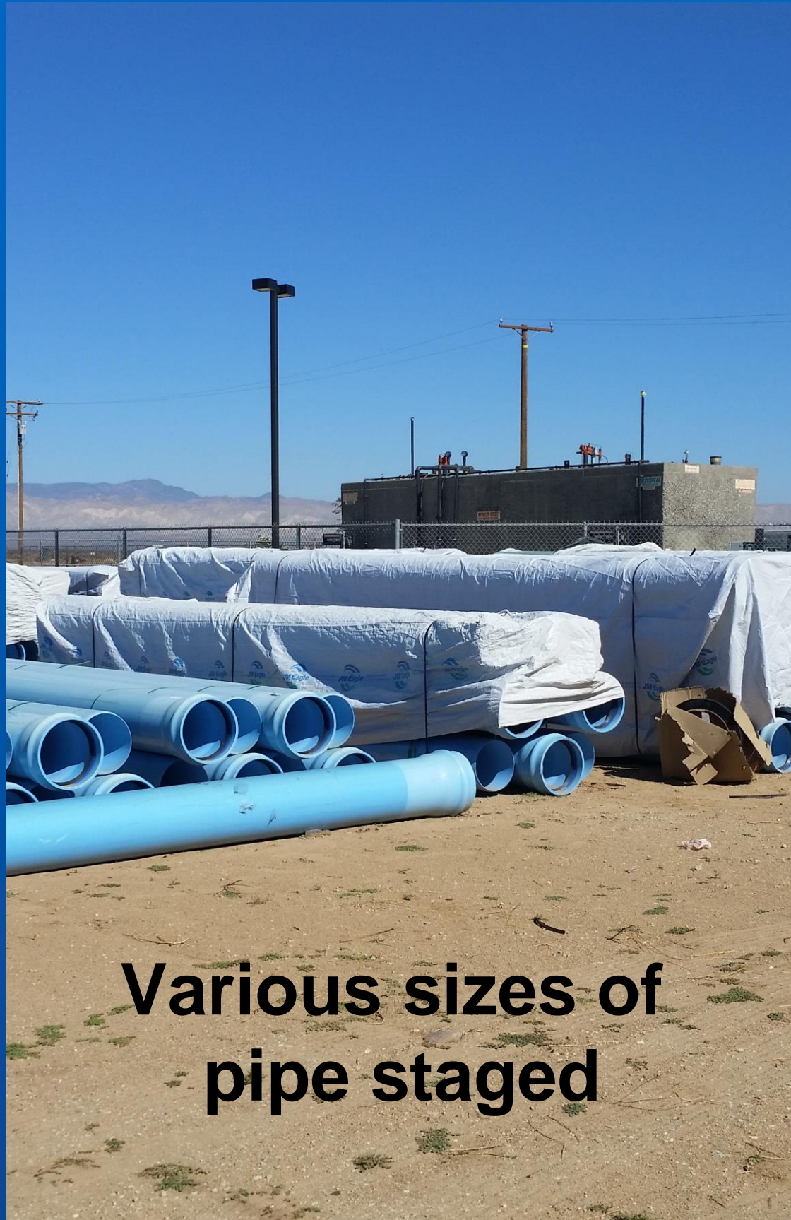
Various sizes of pipe staged