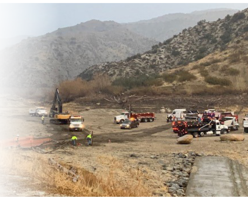
Contractors removing sediment at Littlerock Reservoir.

Citing the severity of the damage to the forest, the U.S. Forest Service has closed this part of the Angeles National Forest to the public through April 1, 2022. The closure map can be found at bit.ly/3bhz62p.